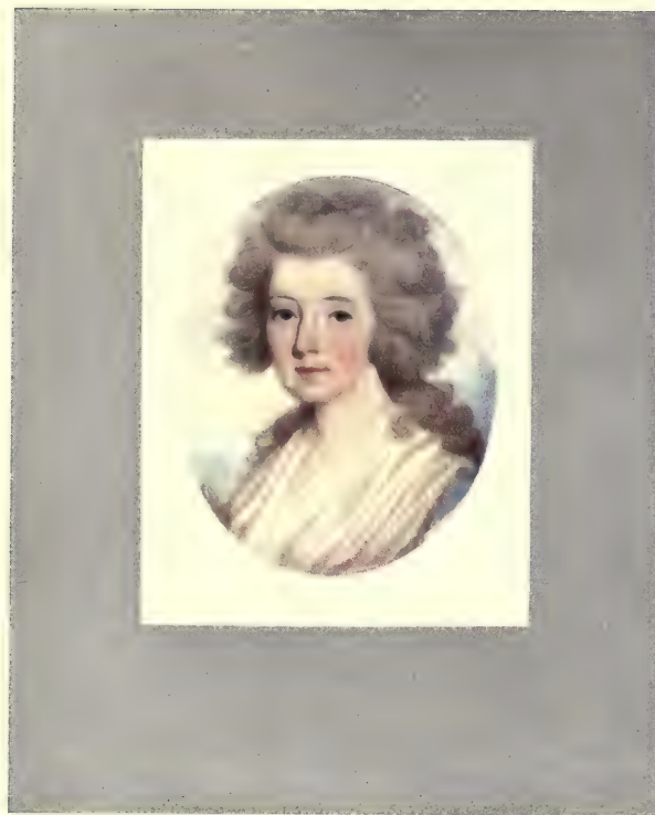
H.R.H. PRINCESS CHARLOTTE OF WALES (1796-1817) BY RICHARD COSWAY, R.A.